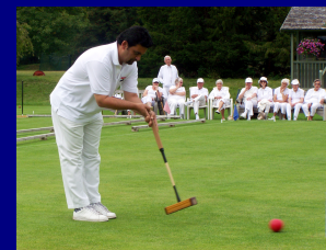
Egyptian International Sherif Nafee