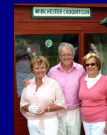
The PCC Trio